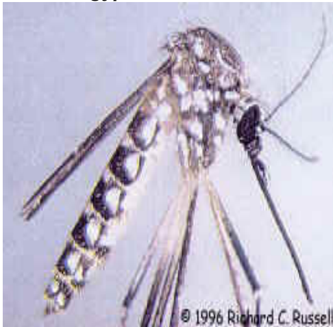
Figure 5: Aedes aegypti

(known as the dengue mosquito in north Queensland), sternites predominantly pale scaled with subapical bands on distal segments.