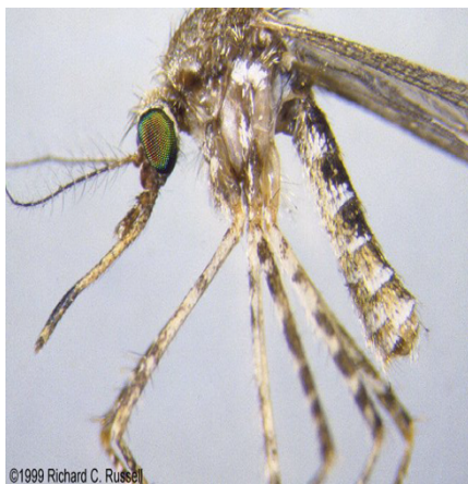
Figure 7: Mansonia uniformis