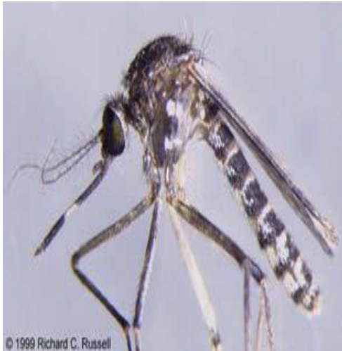
Figure 6: Culex sitiens

same habitat with Aedes vigilax but Culex sitiens also has the ability to adapt to freshwater habits.