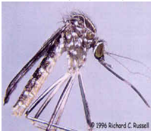
Figure 3: Aedes Notoscriptus/ Ochlerotatus notoscriptus

This species is arguably the major domestic pest species in south-eastern Australia.