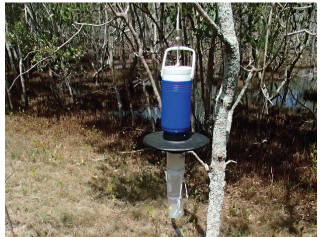
Figure 6: CO2 Light Trap

Routine adult trapping will be undertaken monthly during the dry season and weekly during the wet season. Trap sites are positioned close to known breeding sites to capture the highest possible number of mosquitoes. Additional trapping may be undertaken in response to complaints and to evaluate the effectiveness of control activities.