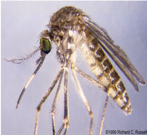
Figure 4: Culex Annulitostris early dry season