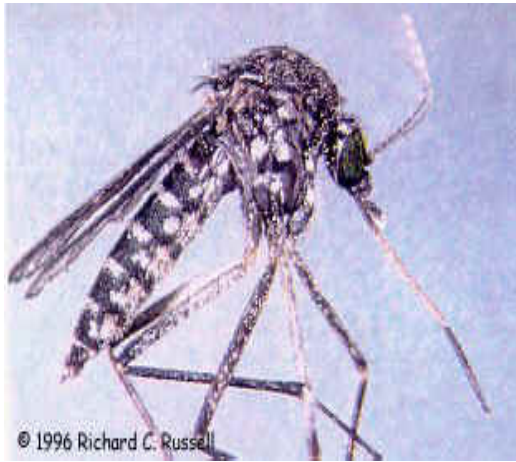
Figure 2: Ochlerotatus Vigilax

Female: A mid-sized mosquito of dark appearance with banded legs; proboscis with pale scaling on basal two-thirds underside; scutum with dark bronze and some golden scales; wings dark scaled with sparse mottling of narrow white scales mainly along front veins; hind legs with femur and tibia mottled, tarsi with basal bands; tergites dark with pale basal bands; sternites pale scaled with dark lateral apical or sub-apical patches (occasionally bands).