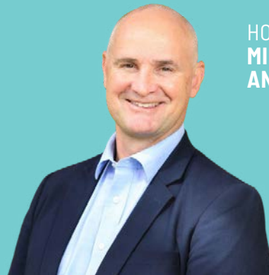
HON GLENN BUTCHER MP - MEMBER FOR GLADSTONE MINISTER FOR REGIONAL DEVELOPMENT AND MANUFACTURING AND MINISTER FOR WATER

This series brings experiences to regions which otherwise wouldn't get the chance to participate in an event of this calibre."