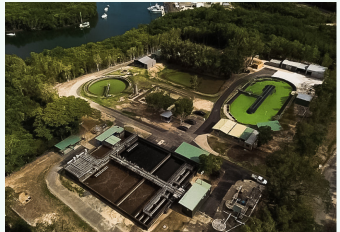
Douglas Shire Council water treatment plant

As an example the Climate Change Initiatives Snapshot showcases the collective actions being taken and the thematic reporting the program provides to promote council actions and advocate for support.