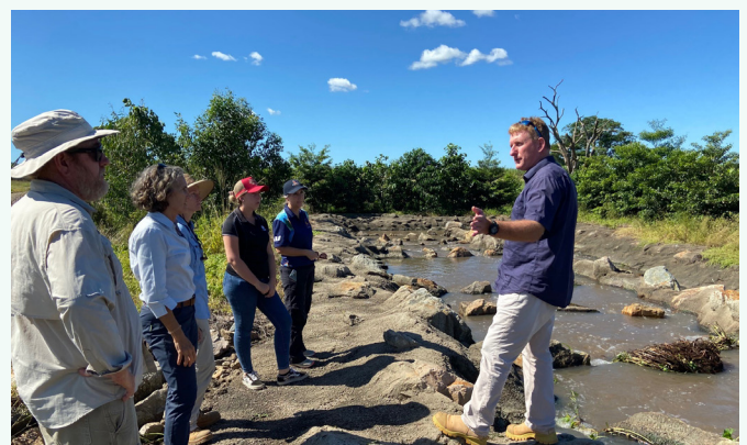
Hinchinbrook Shire Council fish ladders