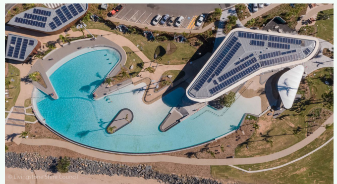
Livingstone Shire Council Yeppoon Lagoon