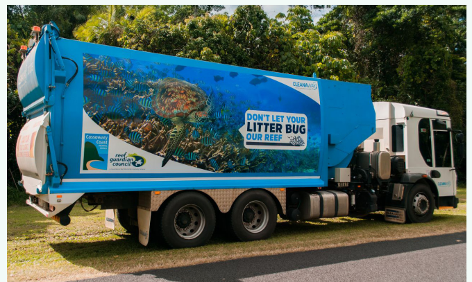
Cassowary Coast Regional Council rubbish collection