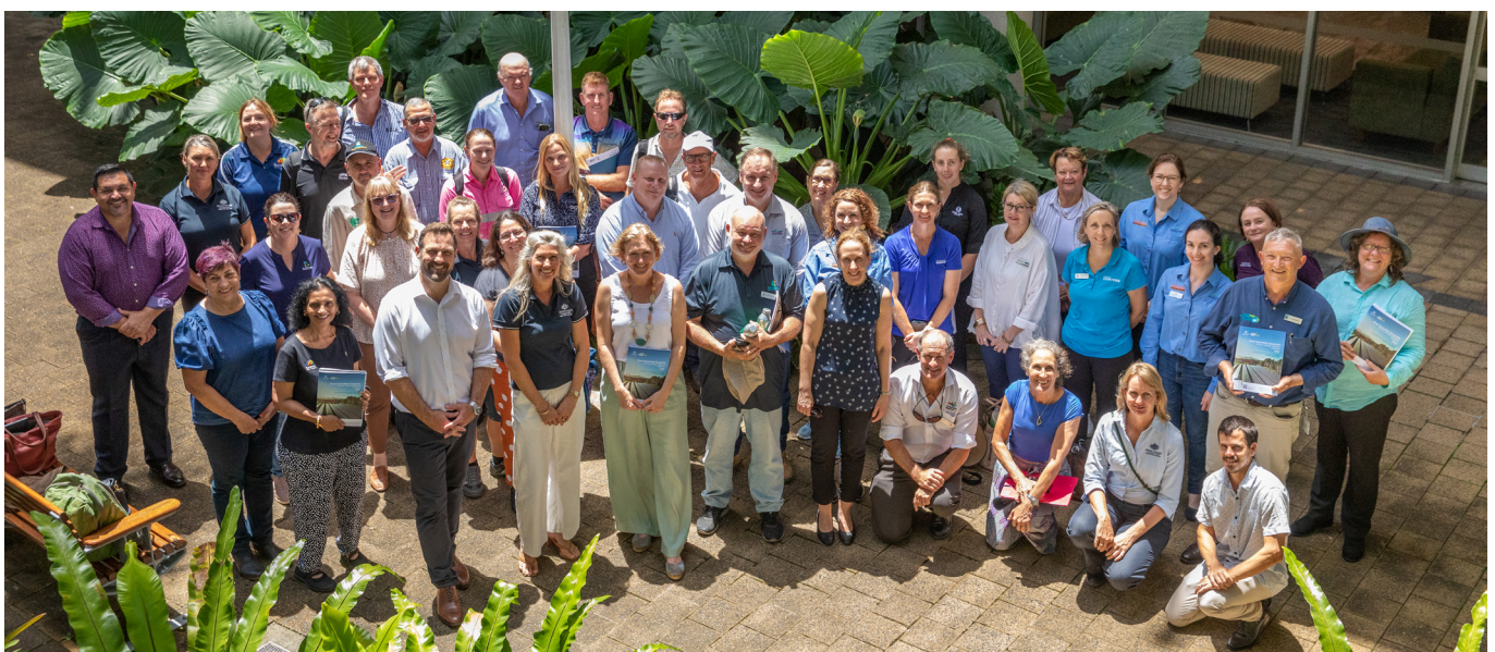
Reef Guardian Council annual meeting