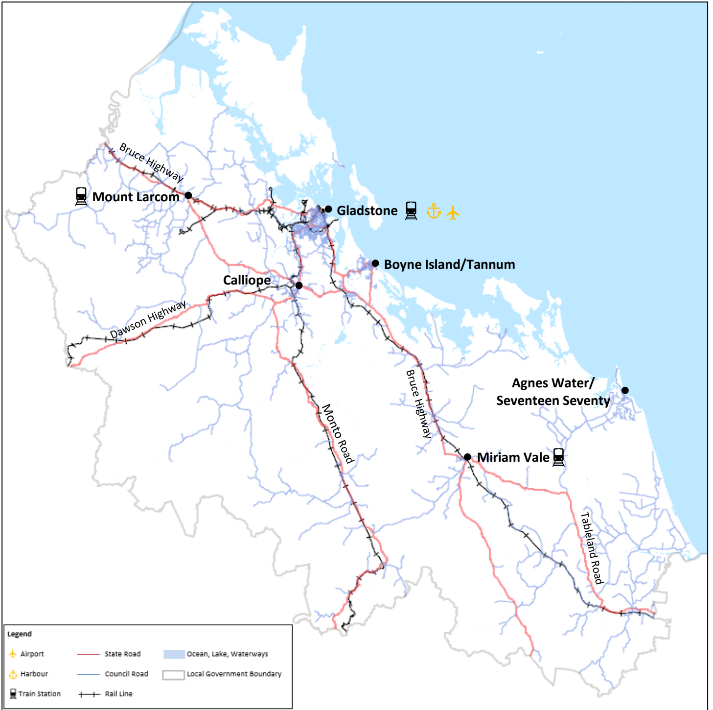
Figure 3 – Gladstone Region Transport Network