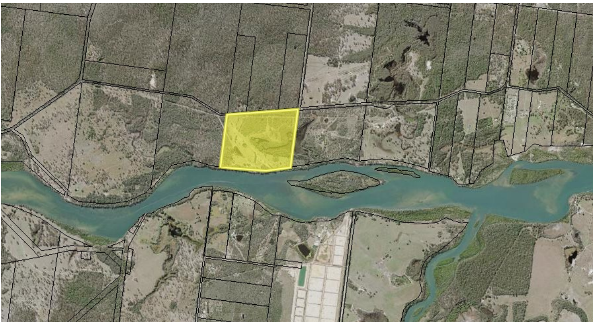
Figure One: Aerial Image of Subject Site

Figure One provides an aerial image of the subject site.