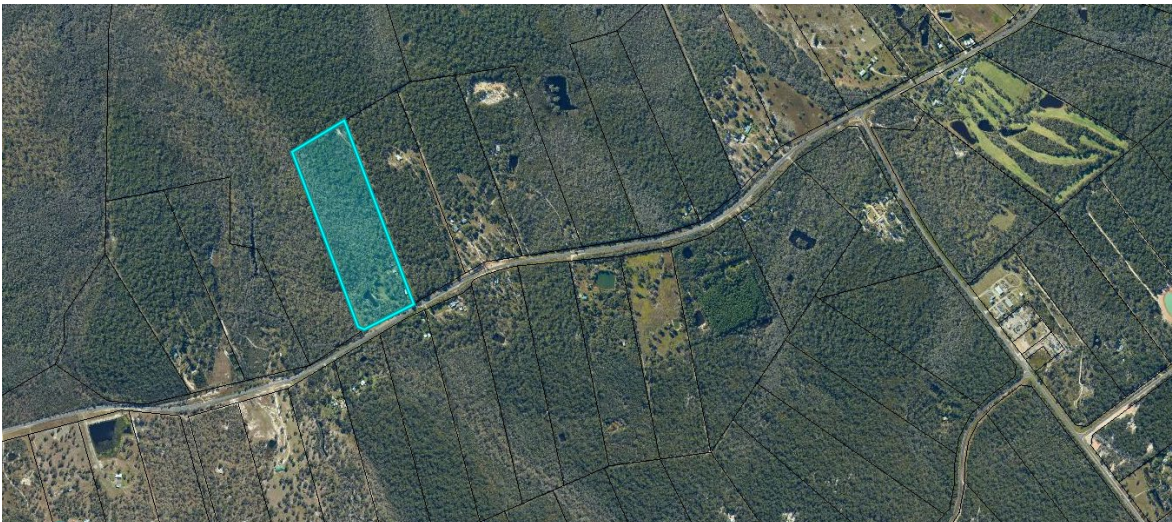
Figure One: Aerial Image of Subject Site

Figure One provides an aerial image of the subject site.