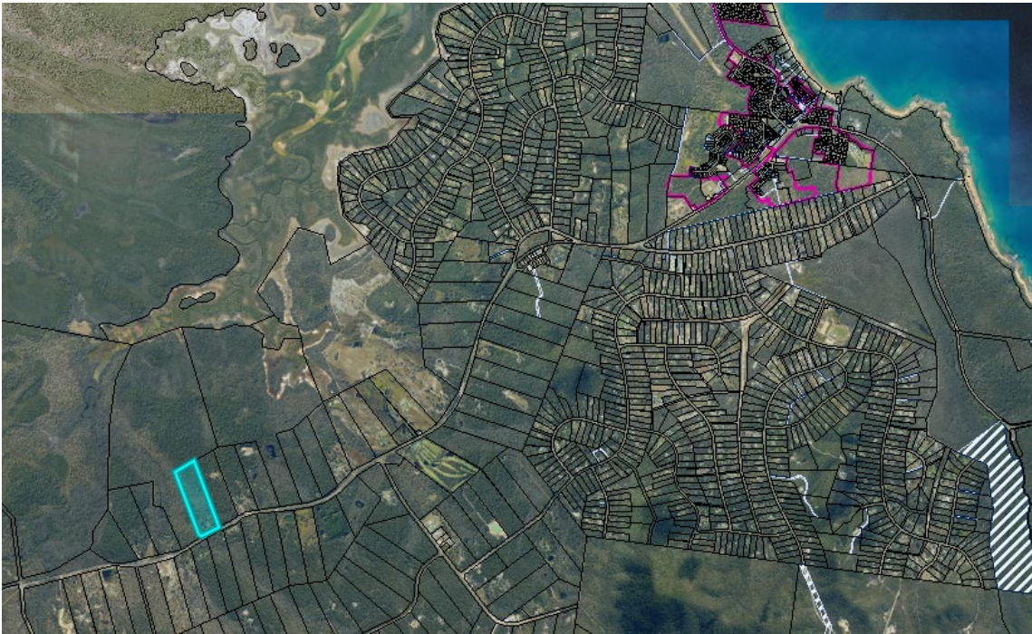
Figure Three: Subject Sites proximity to mapped PIA

As the site is situated outside the Priority Infrastructure Area (PIA) and is not located within the Township Zone, the request is not consistent with the third prerequisite.