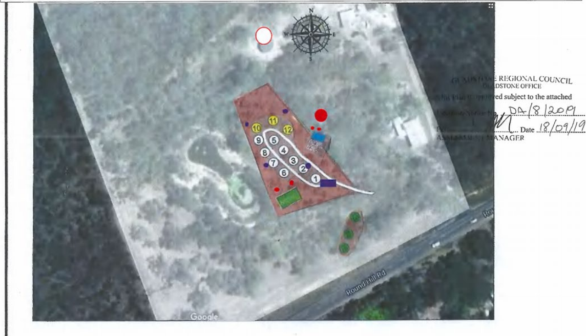
Figure Two: Approved Site Plan

(3) (2) (c) The division of the camping ground into camp sites including the location & number of potential camp sites with each site clearly defined and bearing a distinguishing number / mark. Stage 1 sites are marked as white circles. Stage 2 proposed sites are marked as yellow circles. Stage 3 proposed sites are marked as green circles. (d) The location of each road & building (Ablution building in blue - Kitchen building in green/Stage 3) situated within the camping ground. (f) The position of all waste containers (marked purple circles, purple rectangle is the waste and recycling station) (j) The nature & position of all fire safety installations (marked red) 15000 l potable water tank behind toilet block, 160000 l Water tank, clearly labelled, easily accessible and with fire brigade fittings, located within 100 m of camping area