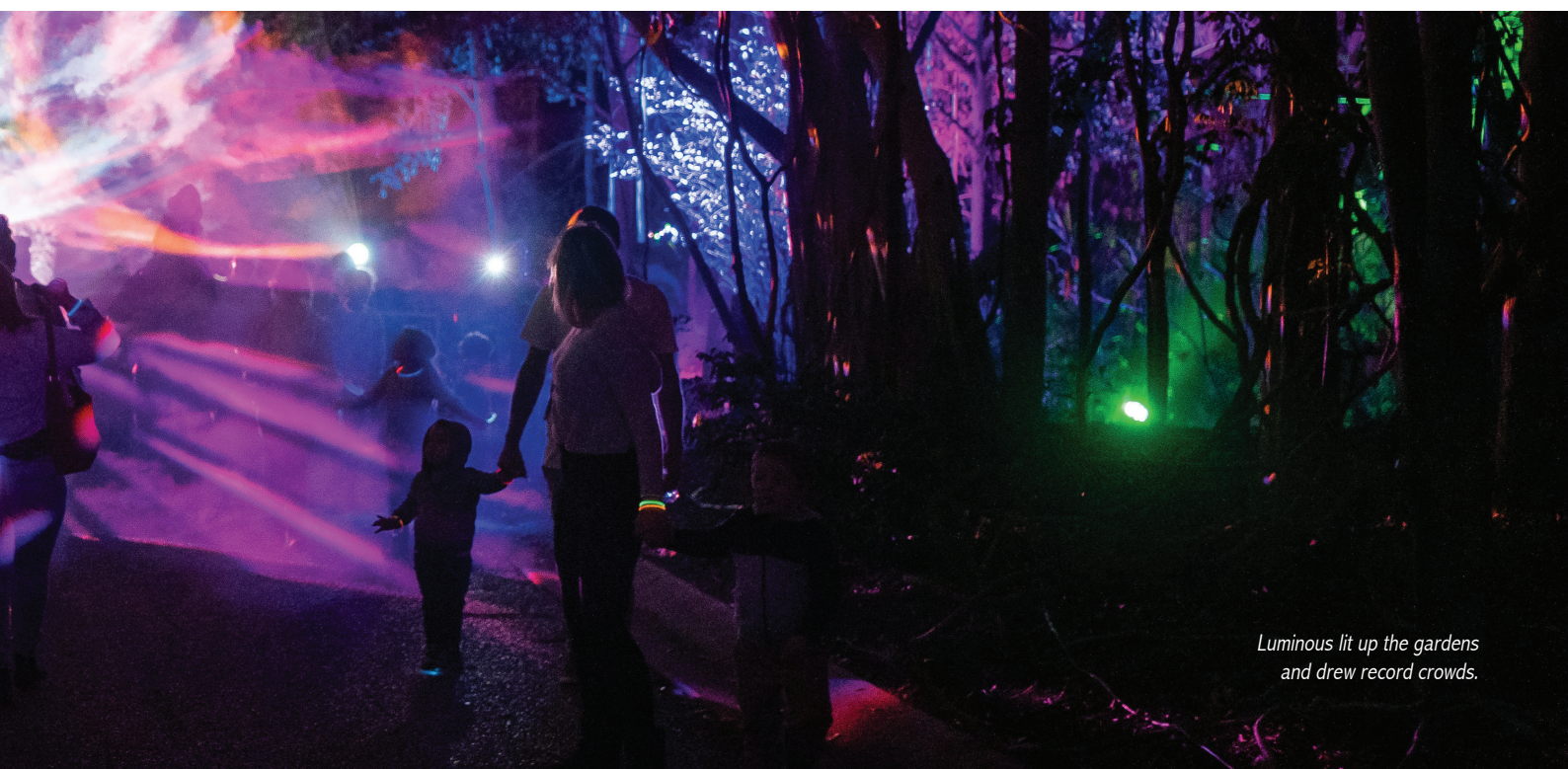
Luminous lit up the gardens and drew record crowds.